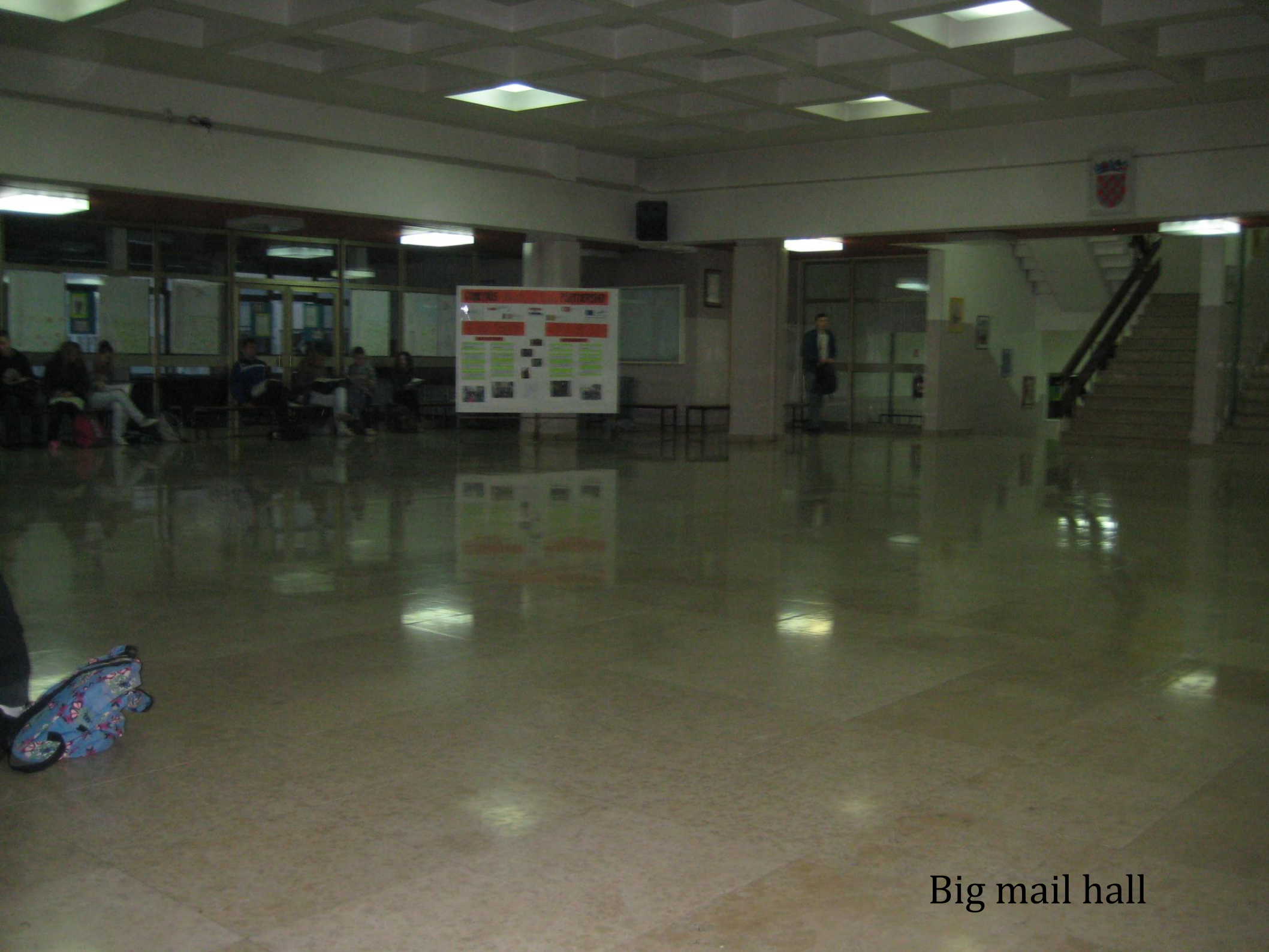
Big mail hall